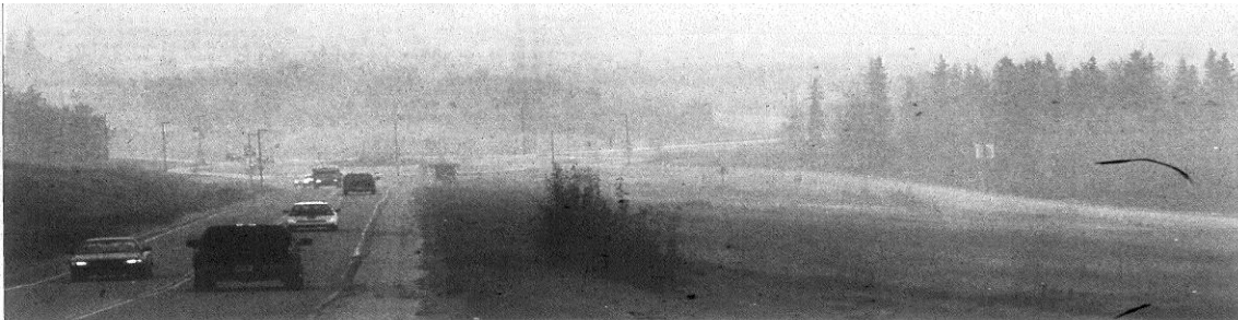
Smoke blankets Fairbanks as traffic moves along Tanana Loop on the University of Alaska Fairbanks campus on Thursday. The thick smoke pouring in from wildfires has caused the Fairbanks North Star Borough to issue an air quality advisory for the area.