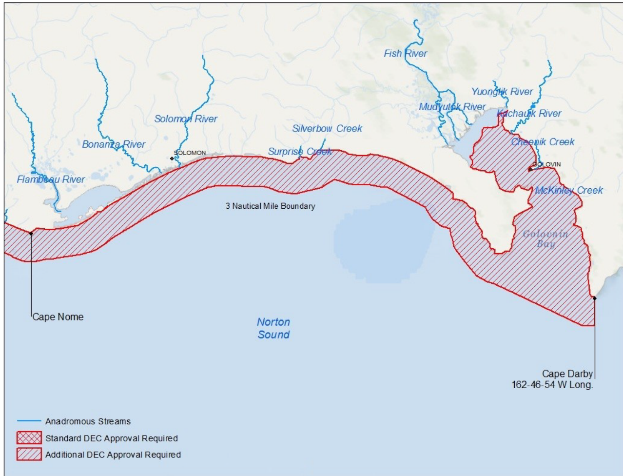
Table D3: Anadromous Waters a – Cape Nome to Cape Darby