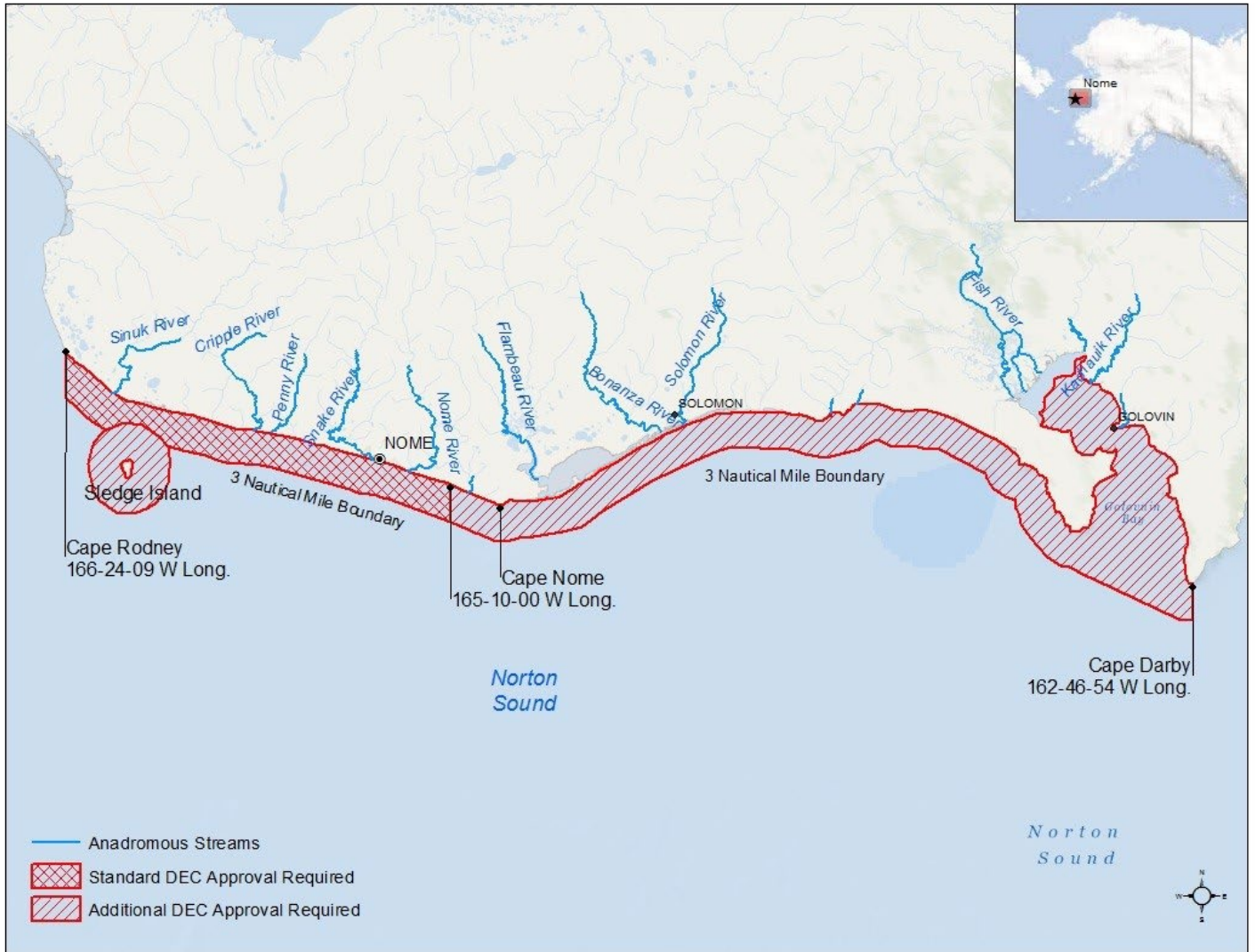
Map D1: Coverage Area

The following map outlines the permit coverage area.