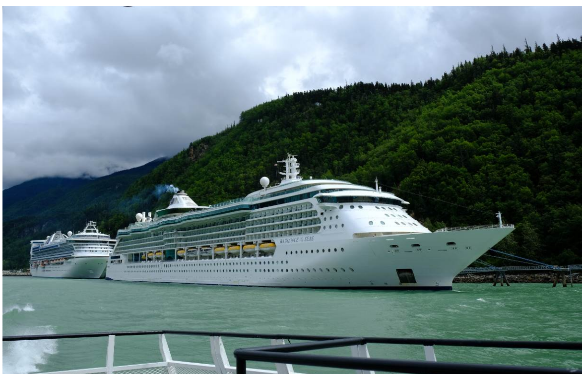
Figure 1: Skagway, AK harbor, 2017