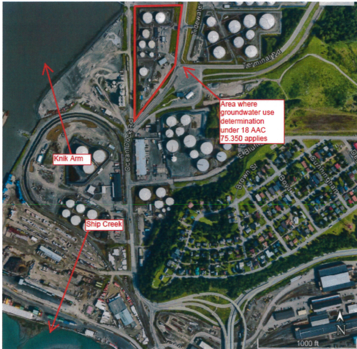
Figure 1- 18 AAC 75.350 Groundwater Use Determination Area