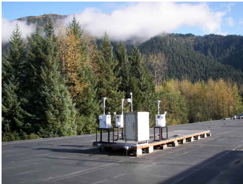
DEC air quality monitoring equipment at Floyd Dryden Middle School in the Mendenhall Valley.