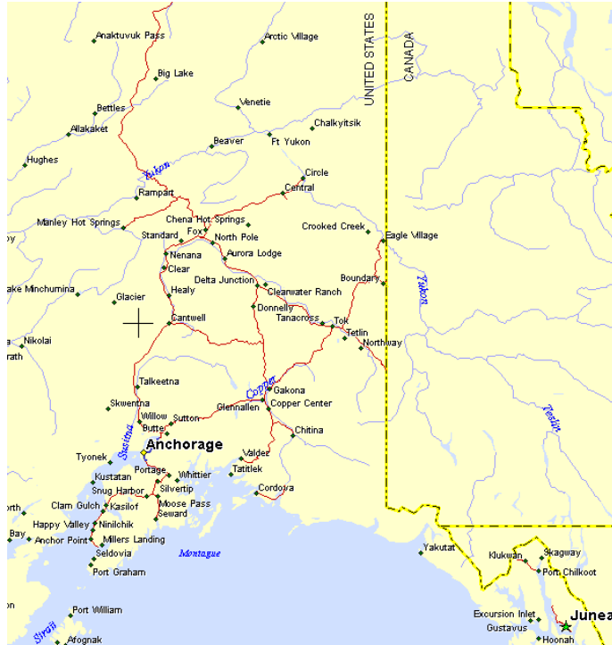
Figure 5-1 Communities on the Alaska Highway System