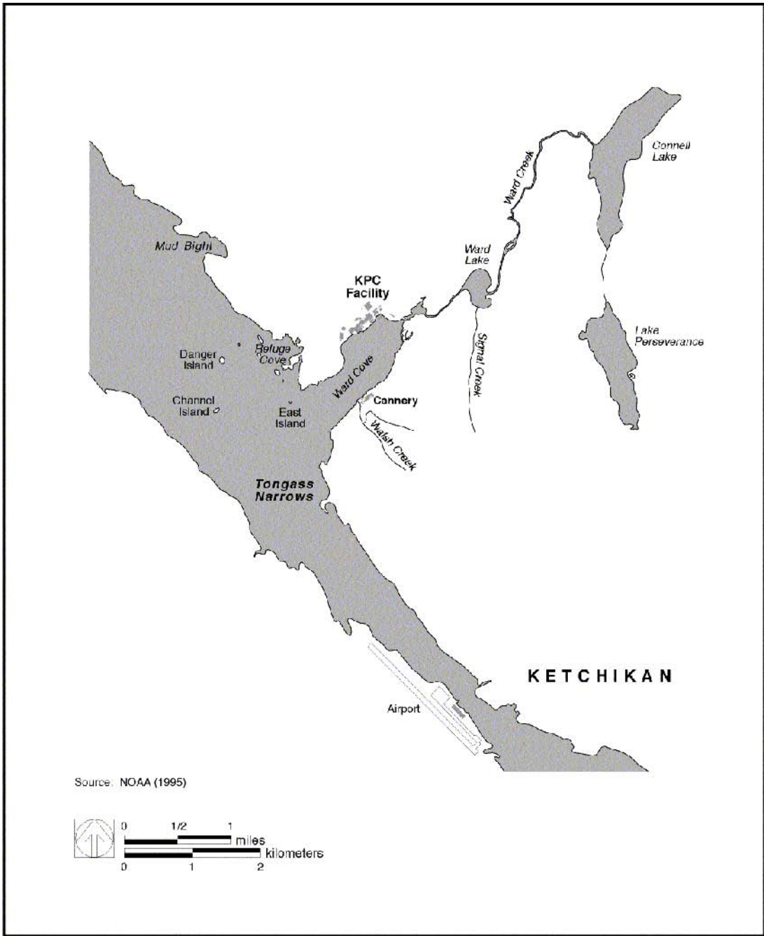
Figure 1. Location of Ward Cove and KPC facility.