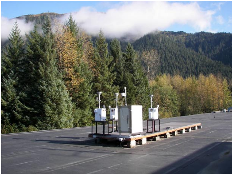
DEC air quality monitoring equipment at Floyd Dryden Middle School in the Mendenhall Valley.