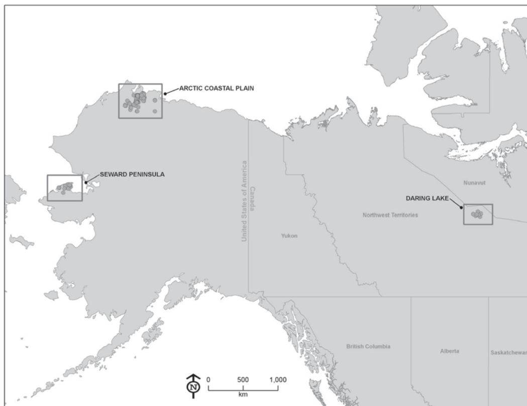
Figure 1. Study sites for sample collection in Yellow-billed Loons, 2002 to 2012.

(Earnst et al. (2005). The landscape is composed of a continuous permafrost environment, with a shallow active layer under tundra plant communities (< 1 m) and somewhat deeper active layers (taliks) underneath lakes. Unlike boreal forest areas, such as those within interior Alaska, where discontinuities in permafrost allow deep subsurface flow and connectivity, the shallow active layers of the ACP and the impermeability of the permafrost trap labile water near or at the surface. Thus, despite the ACP receiving relatively minimal annual precipitation (15-25 cm/year), it is replete with many small and large lakes (> 100,000), as well as highly saturated soils in many plant communities (Walker et al. 2005).