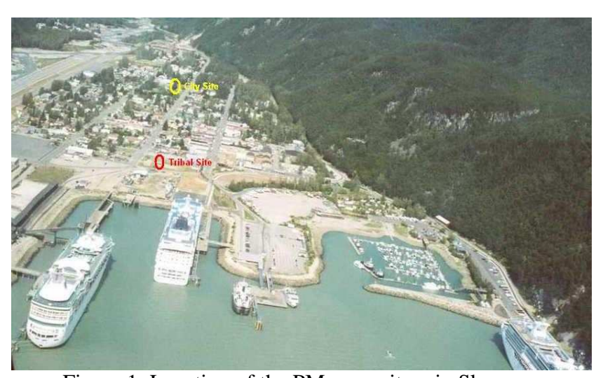
Figure 1: Location of the PM<sub>2.5</sub> monitors in Skagway

After several planning meetings in Skagway to identify candidate monitoring sites, two PM_{2.5} (PM refers to Particulate Matter, and 2.5 refers to the size of the particulates, i.e., 2.5 micrometers or less) monitoring sites were established: one to be operated by the City, the other by the Traditional Council (Figure 1).