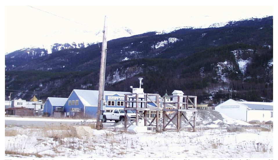
Figure 3: PM<sub>2.5</sub> monitoring site operated by the Skagway Tribal Council

DEC staff shipped air samplers to Skagway in December 2003 and trained local operators on monitoring operation during site start-up at the beginning of 2004. Ambient monitoring at the City site took place on an every sixth day sampling frequency during the first half of 2004, and then on an every third day sampling frequency through the second half of 2004 and the first quarter of 2005. The January to March period was sampled both in 2004 and 2005 to ensure capture of a complete year's worth of fine particulate data. The Traditional Council monitoring site ran from February through September 2004 when loss of staff forced them to terminate the project.