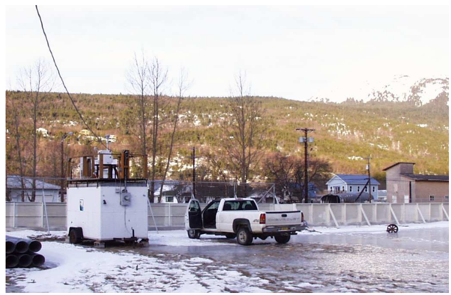
Figure 2: PM<sub>2.5</sub> monitoring site operated by the City of Skagway