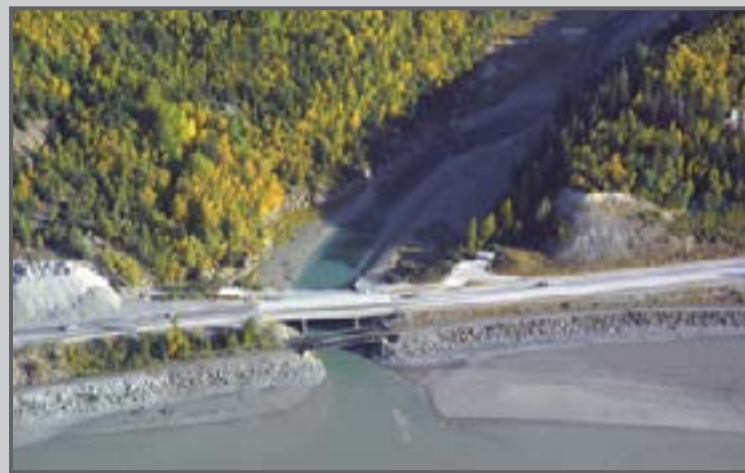
Bird Creek, View North