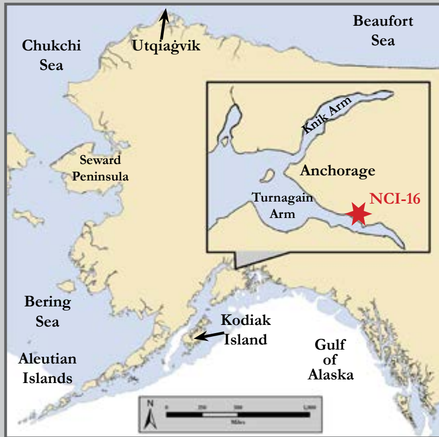
Location of NCI-16