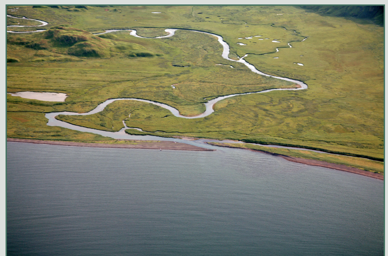
Nateekin Bay, EX-02 a & b seen from the northeast.