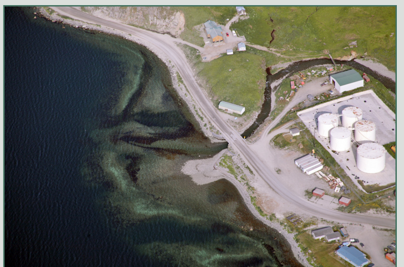
Staging area and EX-02 for Pryamid Creek viewed from the southeast.

Free-oil Containment and Recovery, Protected Water