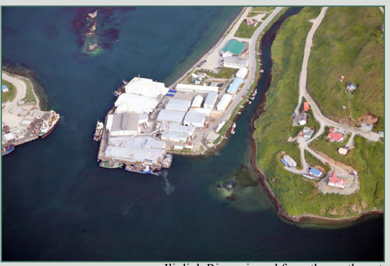
Iliuliuk River viewed from the northwest.