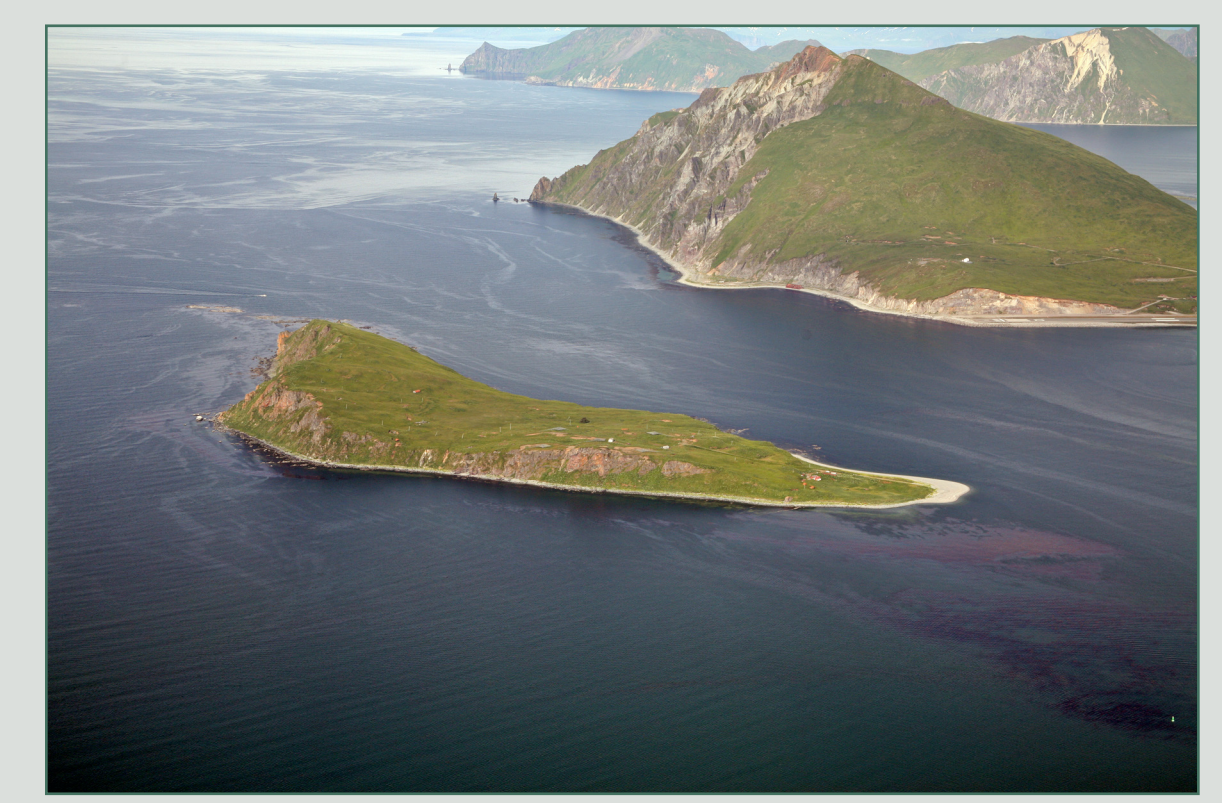
Hog Island viewed from the southeast.