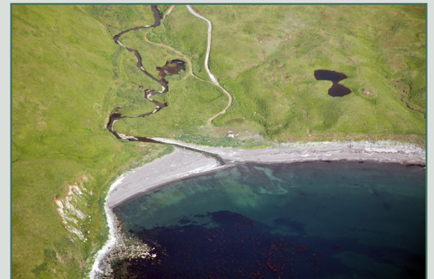
Morris Cove DV-03b viewed from the west.