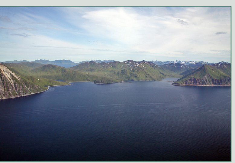
Summer Bay and Morris Cove viewed from the northwest.