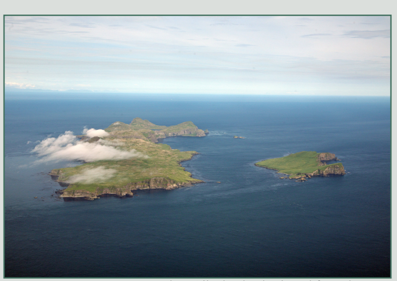
Ugamak & Aiktak Islands viewed from the west.