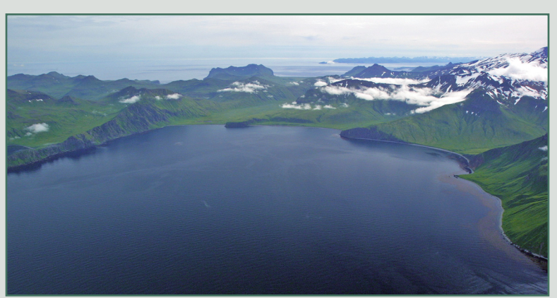
Hot Springs Bay viewed from the north.