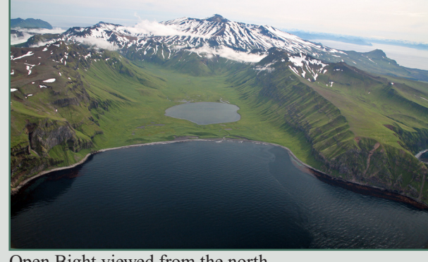
Open Bight viewed from the north.