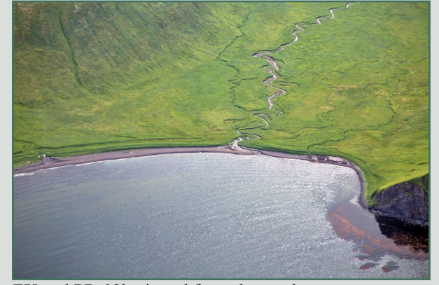
EX and PR-02b viewed from the northeast.