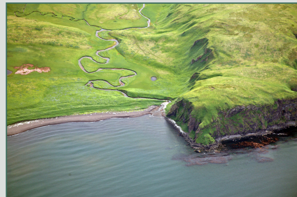
EX and PR-02a viewed from the north.