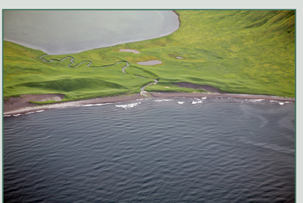
EX and PR-02d Open Bight stream viewed from the