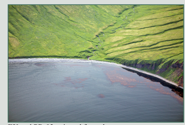
EX and PR-02c viewed from the east.