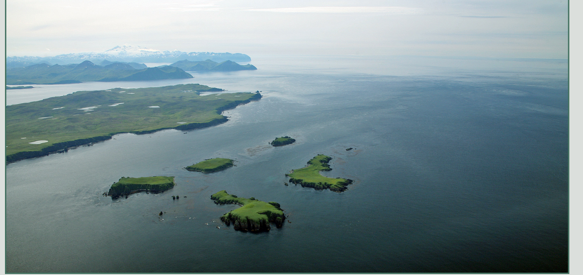
Unalga and Baby Islands viewed from the southeast.