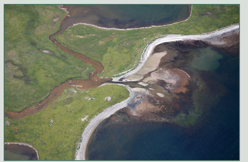
Kashega Bay streams viewed from the east.