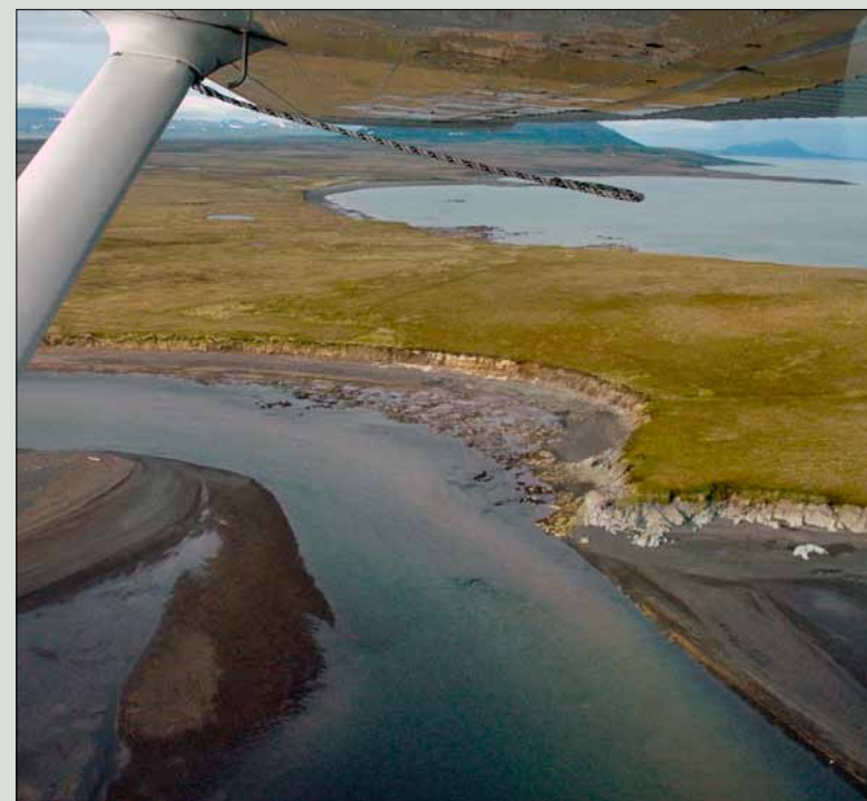
The entrance of the Osviak River viewed from the south.