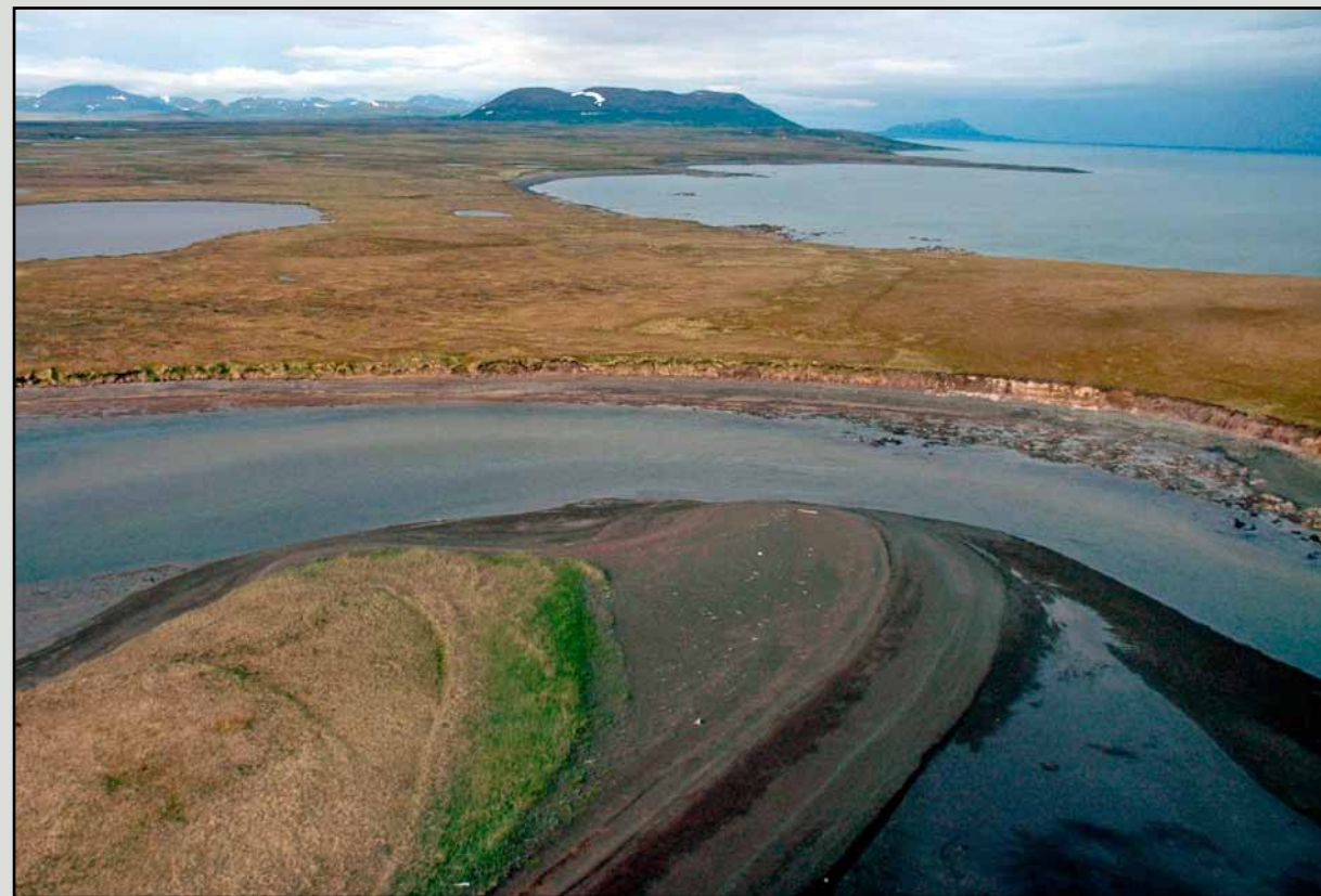
The entrance of the Osviak River viewed from the southeast.