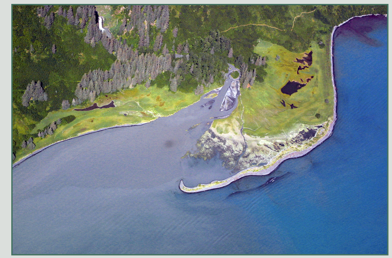
PWS NE-15 Gold Creek looking northeast.