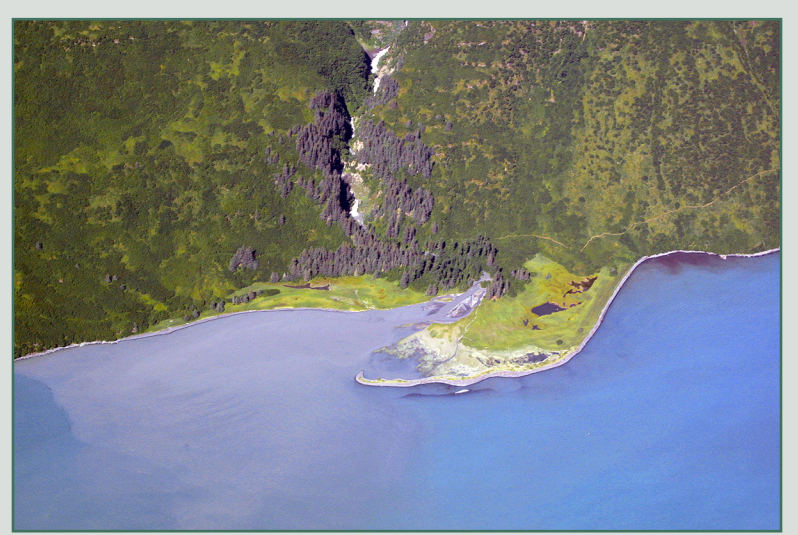
PWS NE-15 Gold Creek looking north.