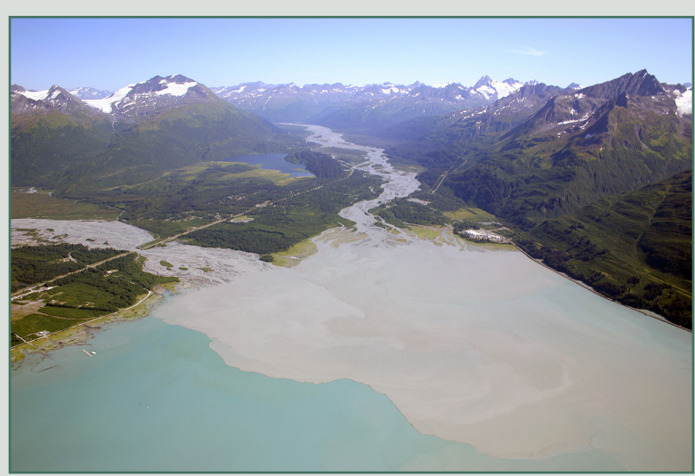
PWS NE-18 Robe and Lowe Rivers looking east.