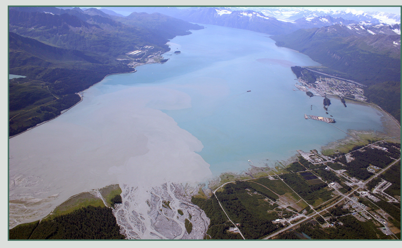
PWS NE-18 looking west from the mouth of Robe River.