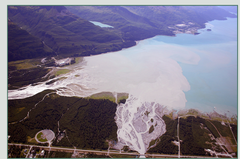
PWS NE-18 looking southwest from the mouth of Robe River into the bay.