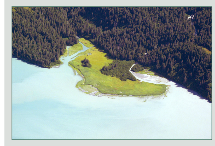
PWS-NE20-02 Sawmill and Salmon Creeks looking south.