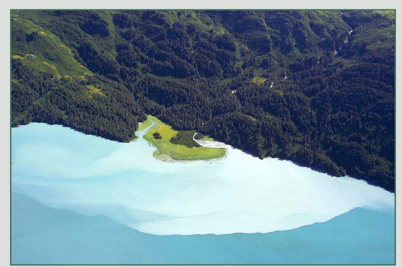
PWS-NE20 Sawmill and Salmon Creeks looking south.