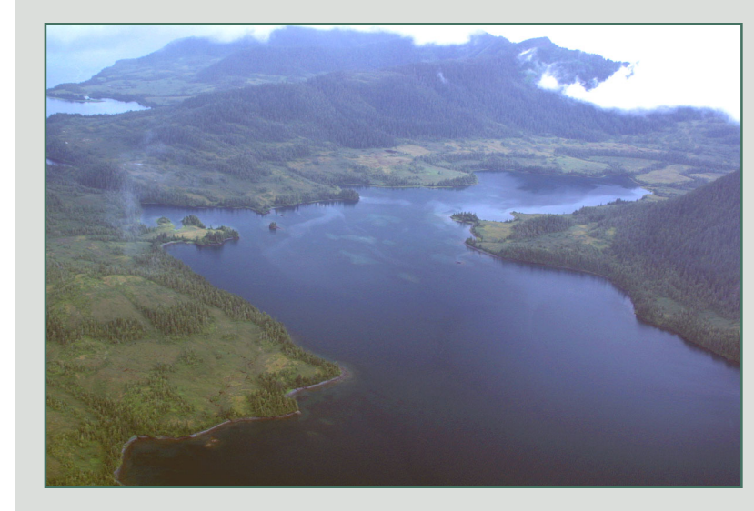
NE-07 West Bay Bligh Island viewed from the northeast.