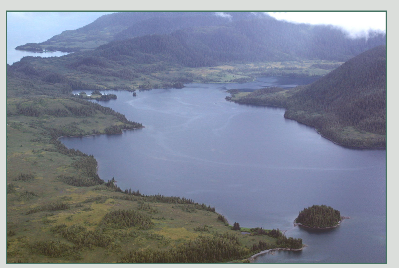
NE-07 West Bay Bligh Island viewed from the north.