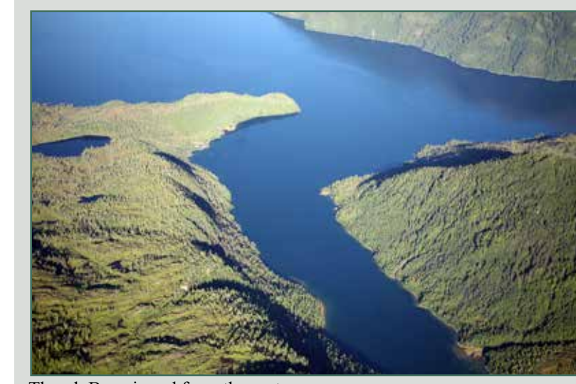
Thumb Bay viewed from the east.