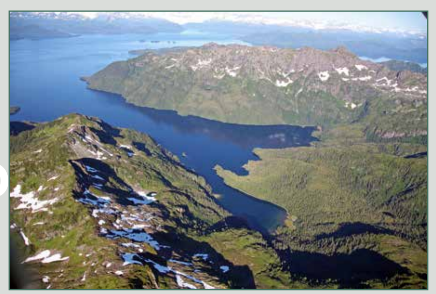
The head of Mummy Bay viewed from the northeast.

Free-oil Containment and Recovery, Shallow Water