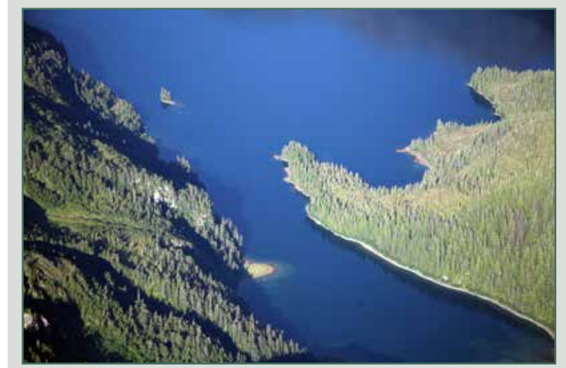
EX-03a viewed from the north.