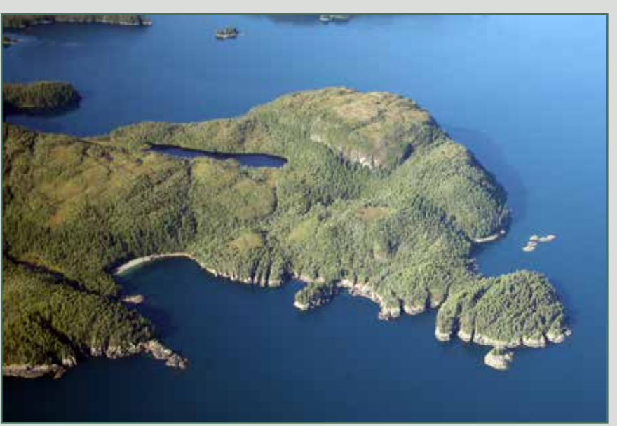
Point Eleanor view from the east.