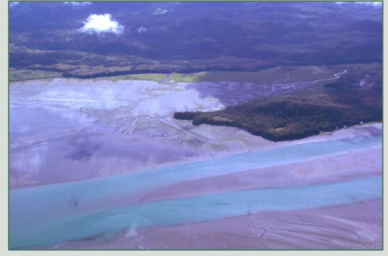
SE-05-03 Hartney Bay viewed from the north.