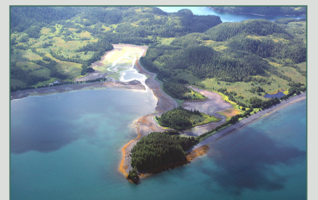
SE-06-03a and -05Canoe Point viewed from the north.

Free-oil Containment and Recovery, Shallow Water