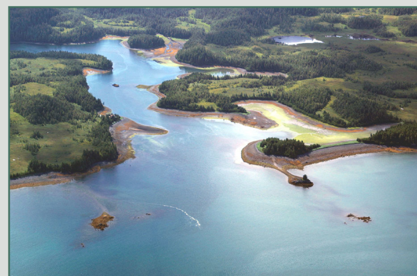
SE-06-02 Canoe Passage viewed from the north.