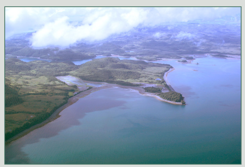
SE-06 Canoe Passage viewed from the northeast.

Free-oil Containment and Recovery, Shallow Water