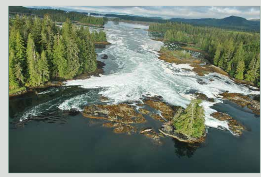
DV01a, Crab Bay, viewed from the east.