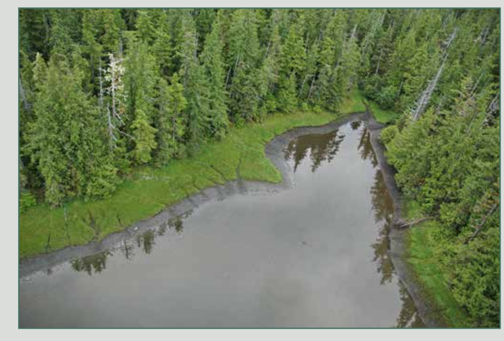
EX01c viewed from the southwest.