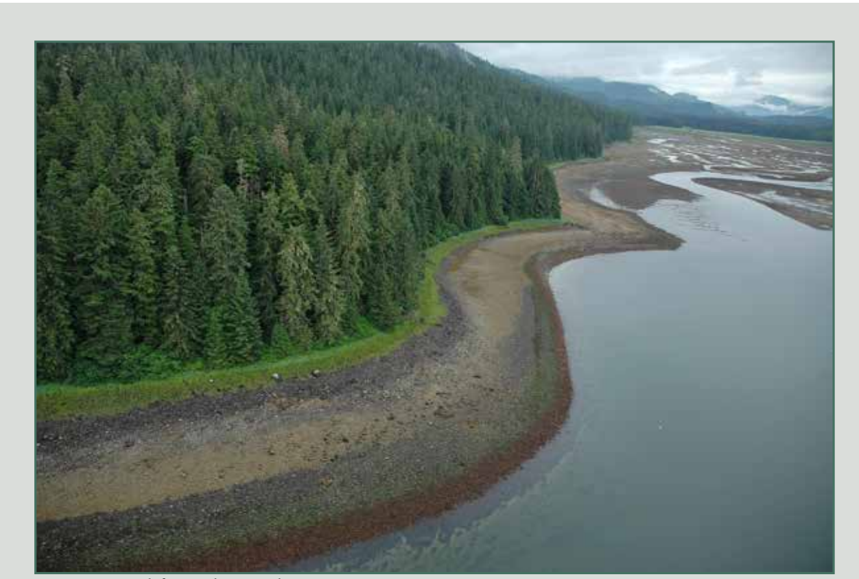
DV01 viewed from the northeast.