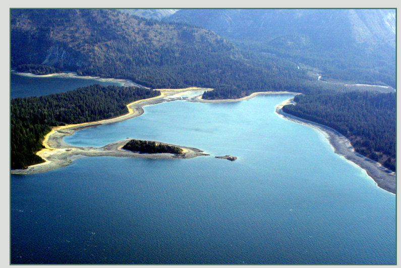
SE06-09 Looking east into South Sandy Cove.