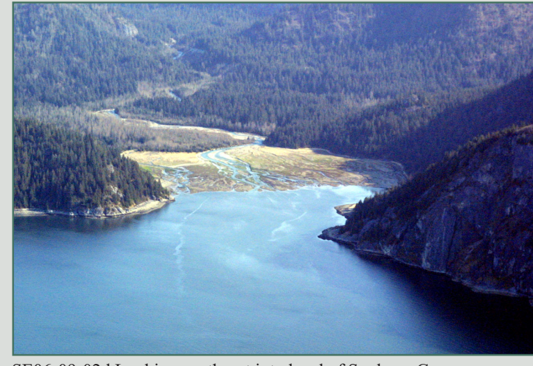
SE06-09-02d Looking northeast into head of Spokane Cove.