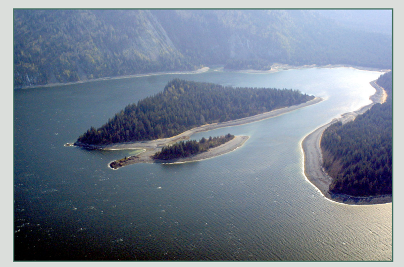
SE06-09 Looking southeast over Puffin Island into North Sandy Cove.