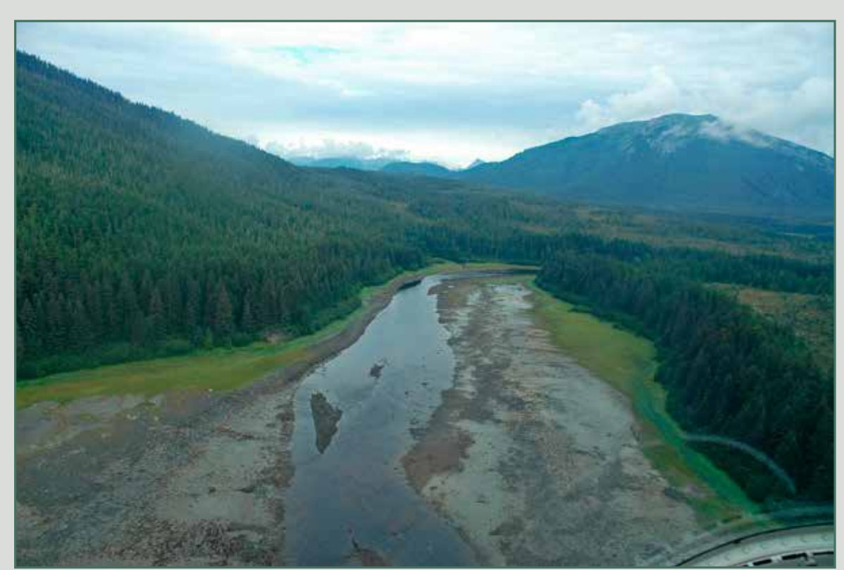
DV01 viewed from the southeast.