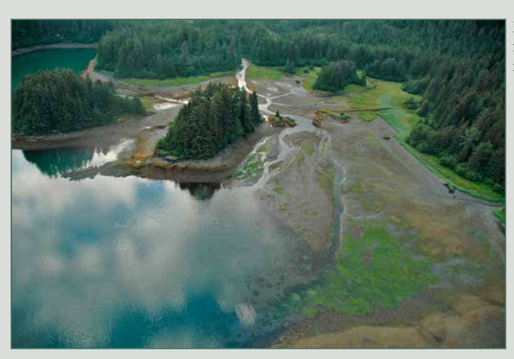
PR02 viewed from the northwest.