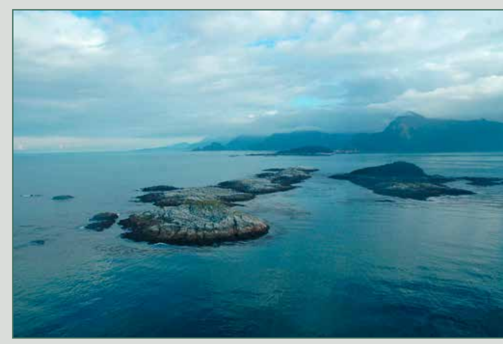
Graves Rock as viewed from the northeast.