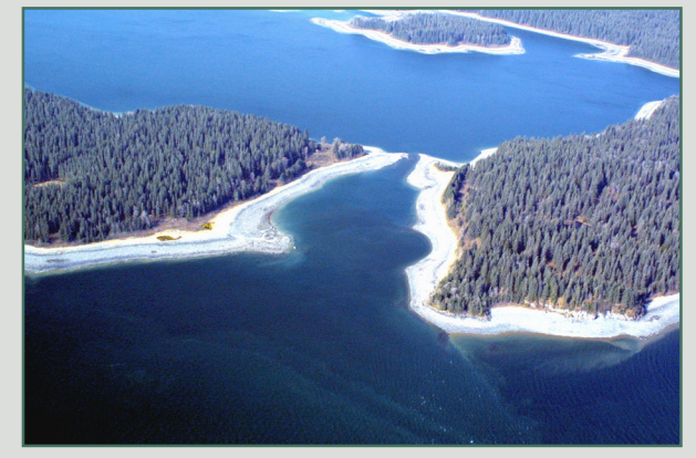
SE06-04-02a Berg Bay/Netland Island looking west.