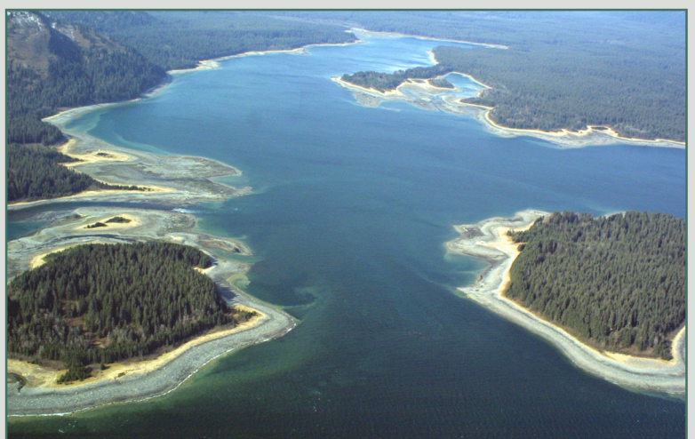
SE06-04-05c Looking west into intertidal cove in Berg