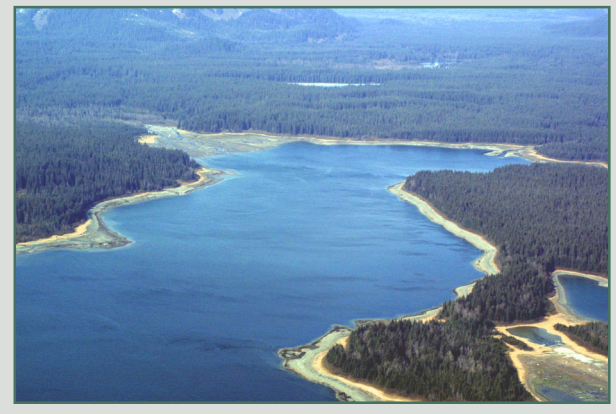
SE06-04-05a&b Head of Berg Bay looking west.