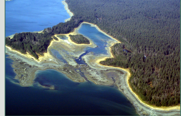
SE06-04-05d Looking west into intertidal cove in Berg