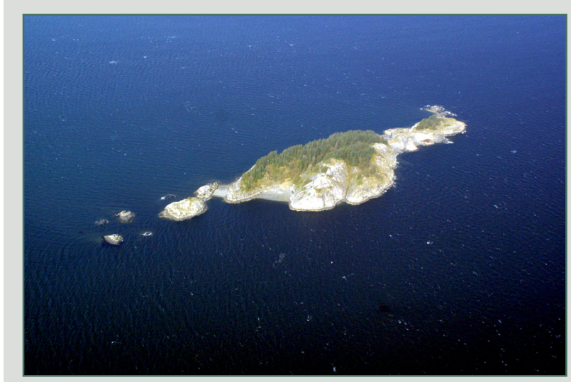
SE06-08 Looking northwest at South Marble Island.