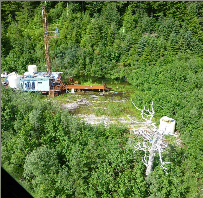
Abandoned Oil Derrick