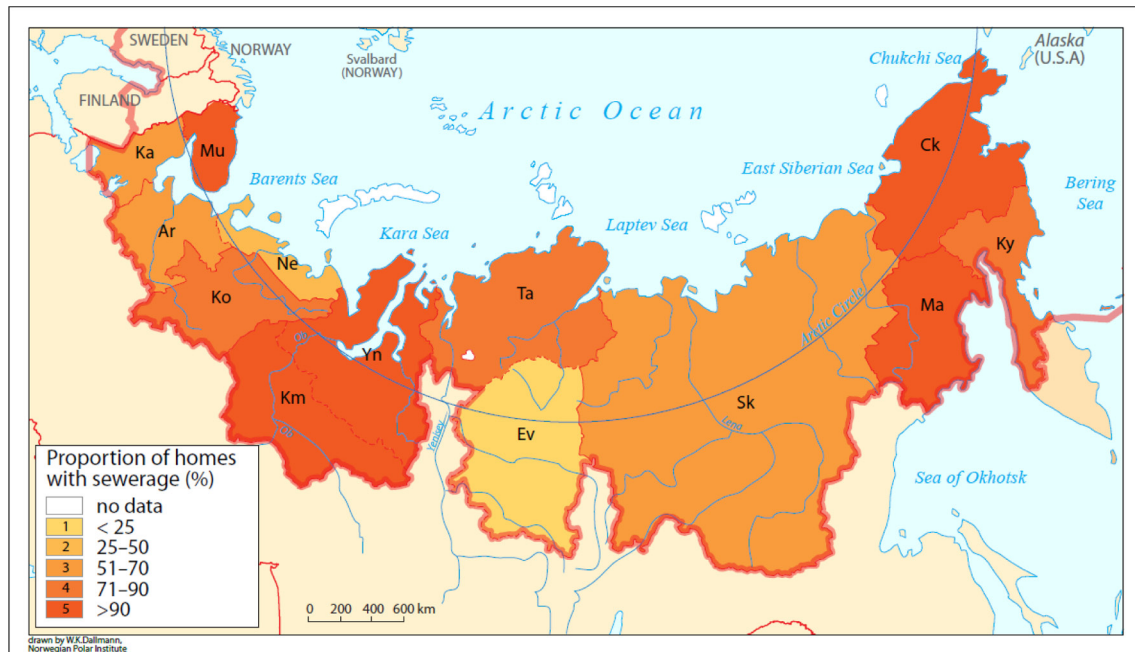
Fig. 2. Proportion of homes in Arctic Russian regions with sewerage installation, 2006/2007 NHDP for Russia.

From 2001 to 2006, the Survey of Living Conditions in the Arctic (SLiCA) was conducted to understand the living conditions in the region, particularly among indigenous peoples (17). This study quantified in-home water access in several areas of the Arctic, showing that access to water services is far from universal. As shown in Fig. 1, in-home access to cold running water ranged from 56% in Northern Greenland to over 99% in all areas surveyed in Canada. Access to hot running water ranged from 49% in Central Chukotka, Russia, to over 99% in Nunavik, Quebec, Canada. In the areas surveyed, having water that was sometimes unsafe to drink ranged from 1% in Northern Greenland to 86% in Nunavut.