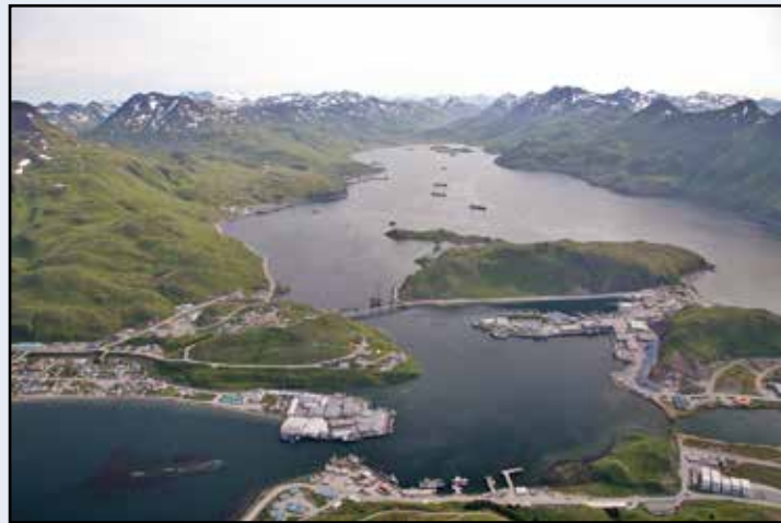
Iliuliuk Harbor and Captains Bay viewed from the north.