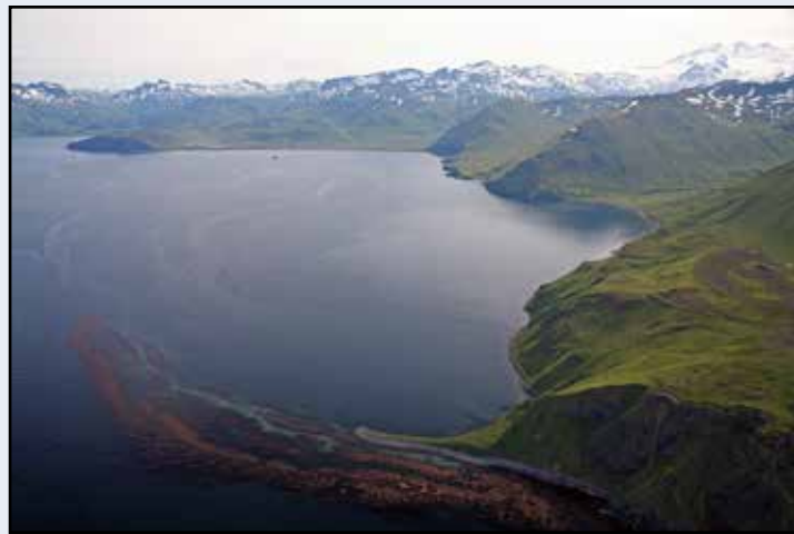
Wide Bay and Broad Bay viewed from the north.