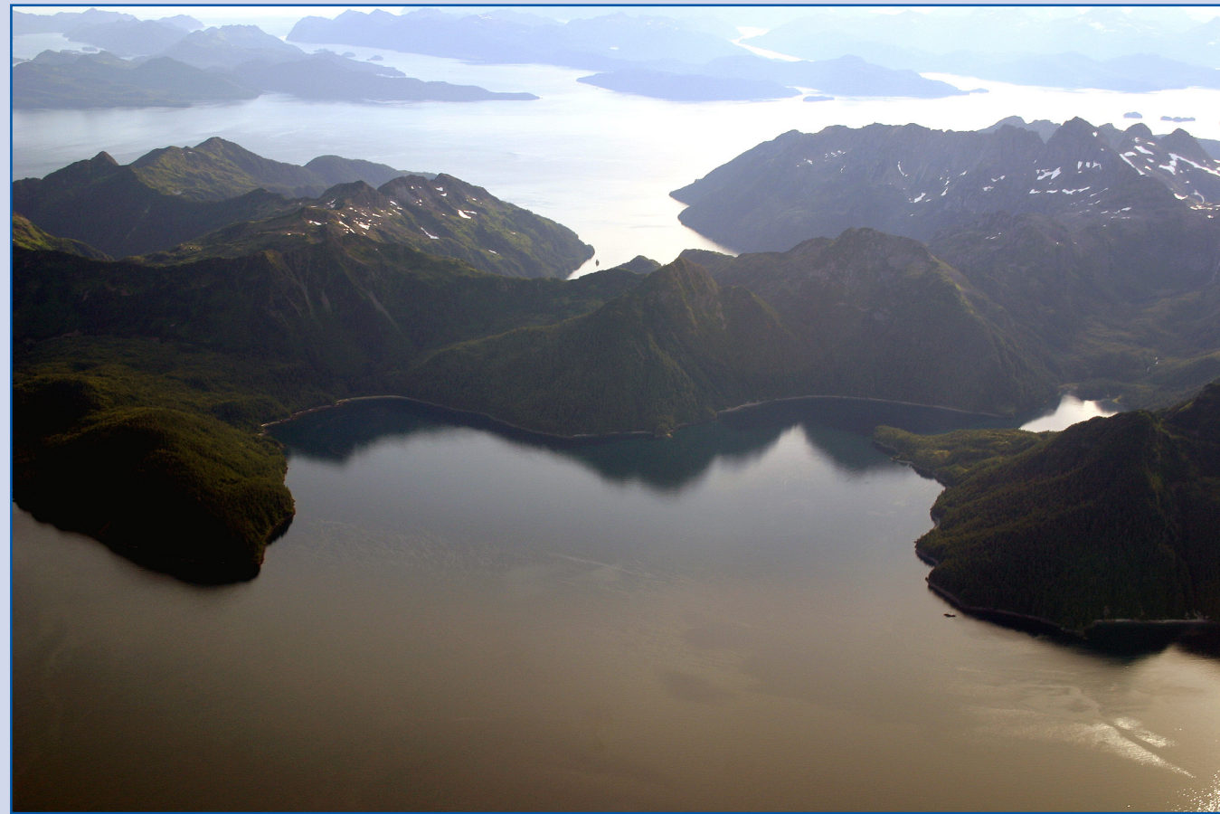
Snug Harbor looking southwest.