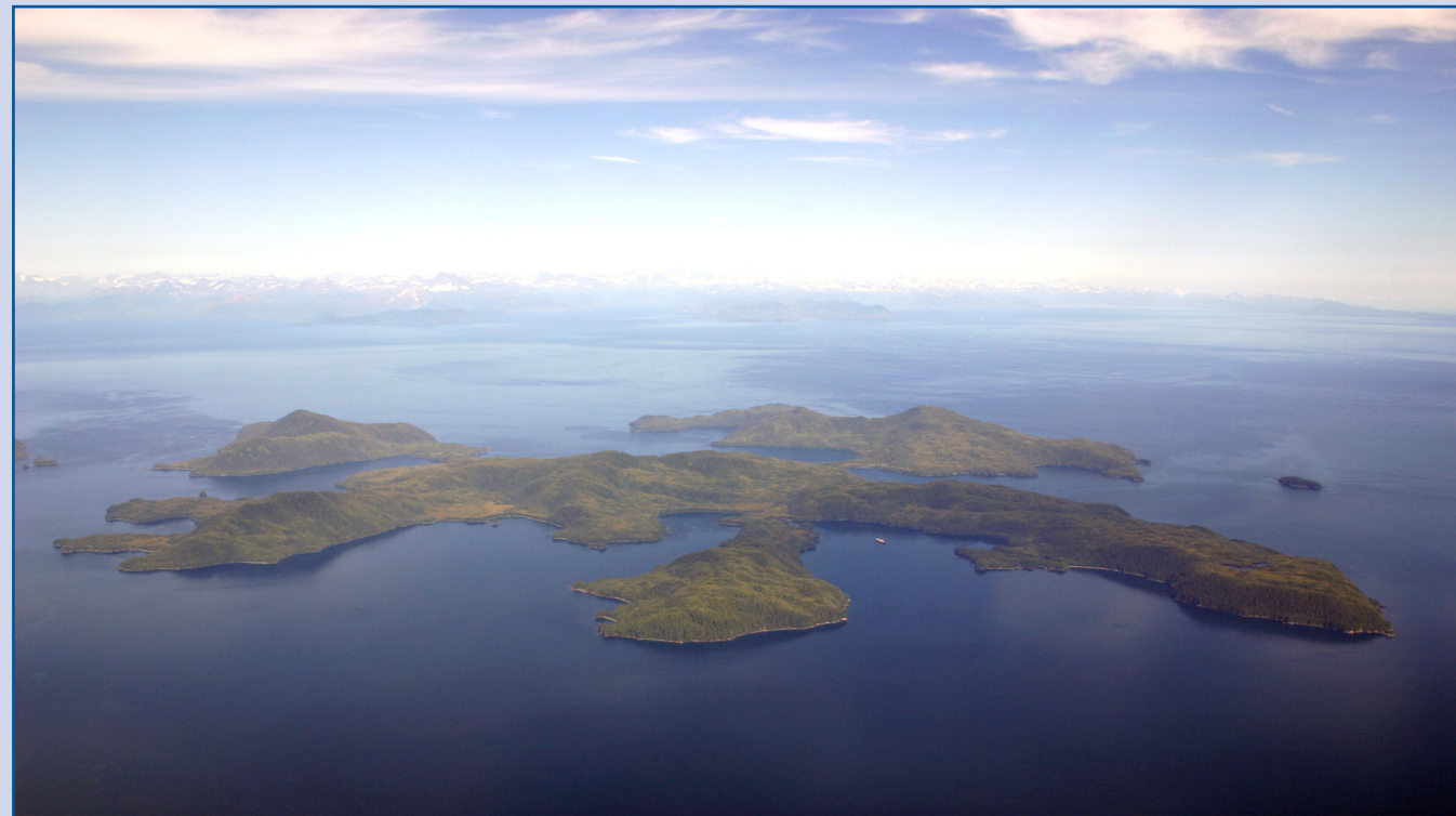
Naked Island looking east.