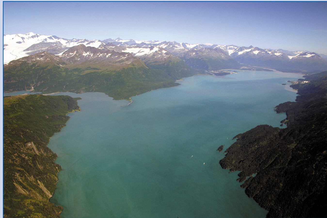
Port Valdez looking east.