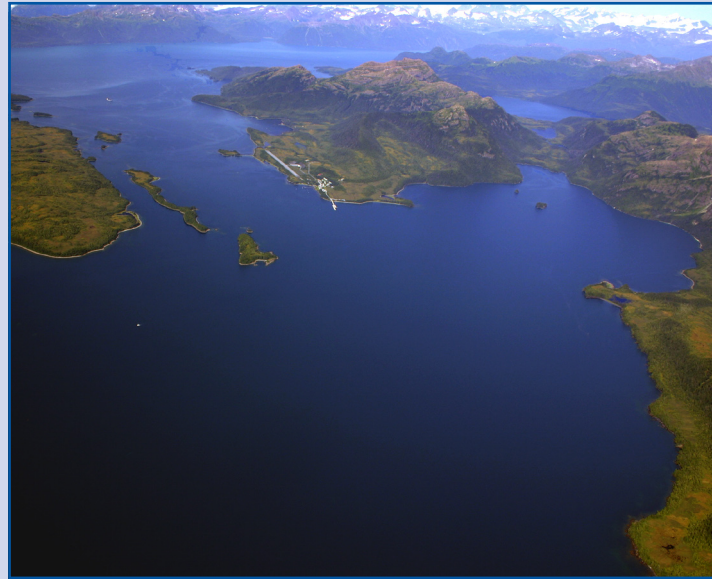
Boulder Bay and Tatitlek Narrows looking northwest.