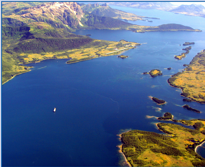
Tatitlek Narrows looking southeast.