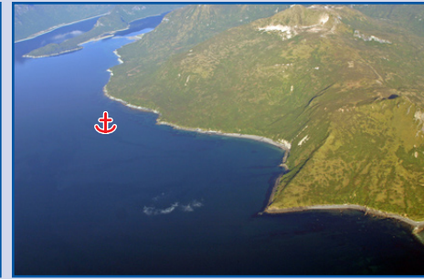
37-D Kuliak Bay from the East.