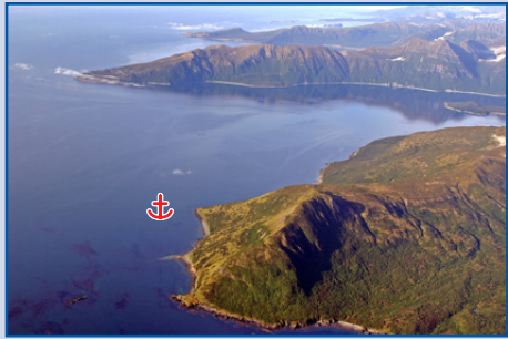
37-D Kuliak Bay from the North.