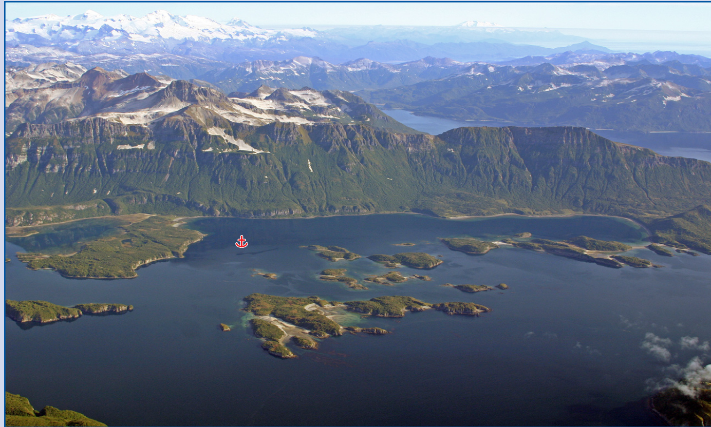
71-L Amalik Bay from the Southwest.