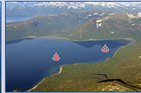
70-L Missak Bay from the East.