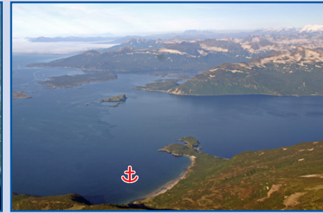
95-S Russian Anchorage from the East.