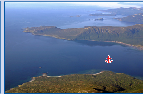
38-D Missak Bay from Northeast.