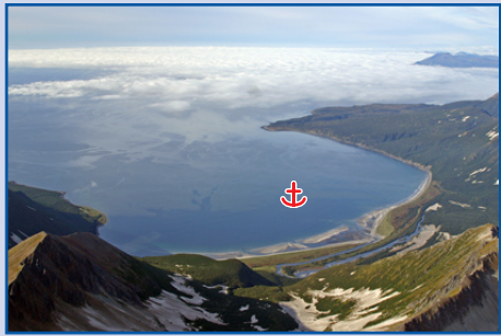
39-D Dakavak Bay from the Northeast.