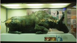
Pleistocene era displays