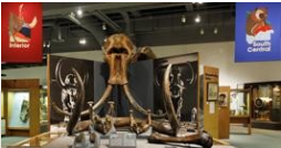
Mammoth display.