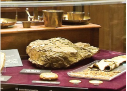
Alaska's largest public gold display