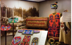
Tlingit regalia gallery