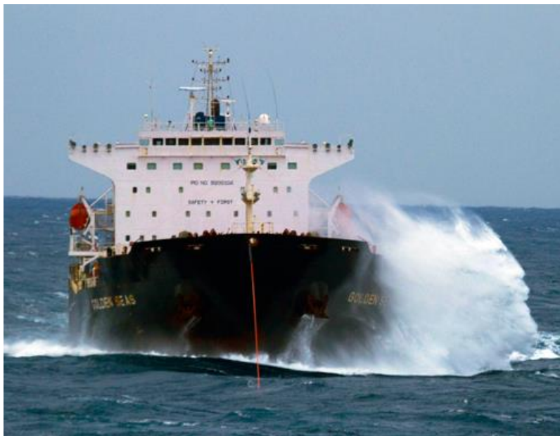
(Photo: M/V Golden Seas being towed to a place of refuge, December 2010)