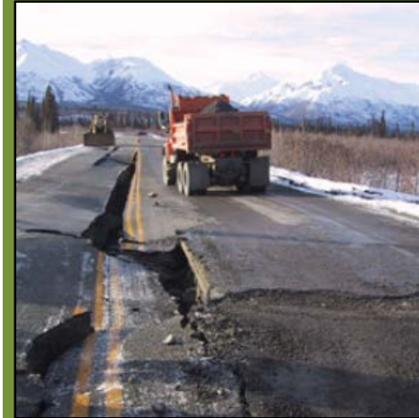
Denali Fault Earthquake (2002), Magnitude 7.9; Photo by DOT & PF