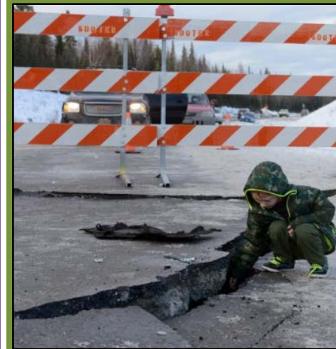
Cook Inlet Earthquake (2016), Magnitude 7.1