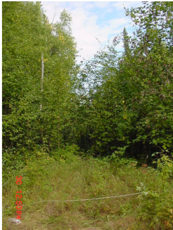
Photo 2: Location SU2. View is of presumed pipeline corridor off of Salcha School ski trail. (Glascott)