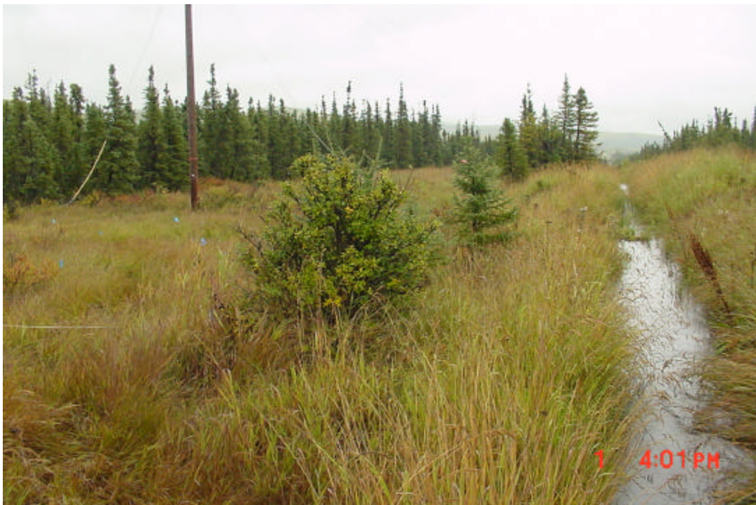
Photo 4: Overview of sampling location SU4. Sampling location was to the left of the water-filled trench. (Glascott)