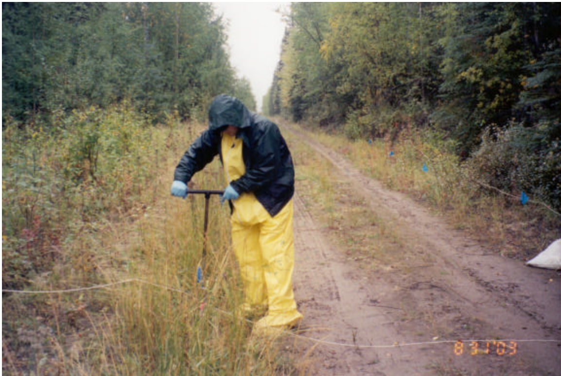
Photo 5: Preparing subsampling points with hand auger at background location BK5, along J. Fowler cabin road. The yellow disposable oversuits were worn as protection from heavy rain and wet brush, not because of concerns of chemical exposure. (Floyd)