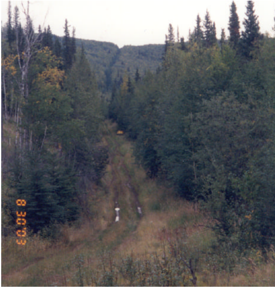
Photo 3: Overview of SU3 area, looking south along corridor. Yellow object in middle of photo is pipeline mile-marker “577”; sampling location SU3 was approximately 200 ft beyond the mile marker. (Floyd)