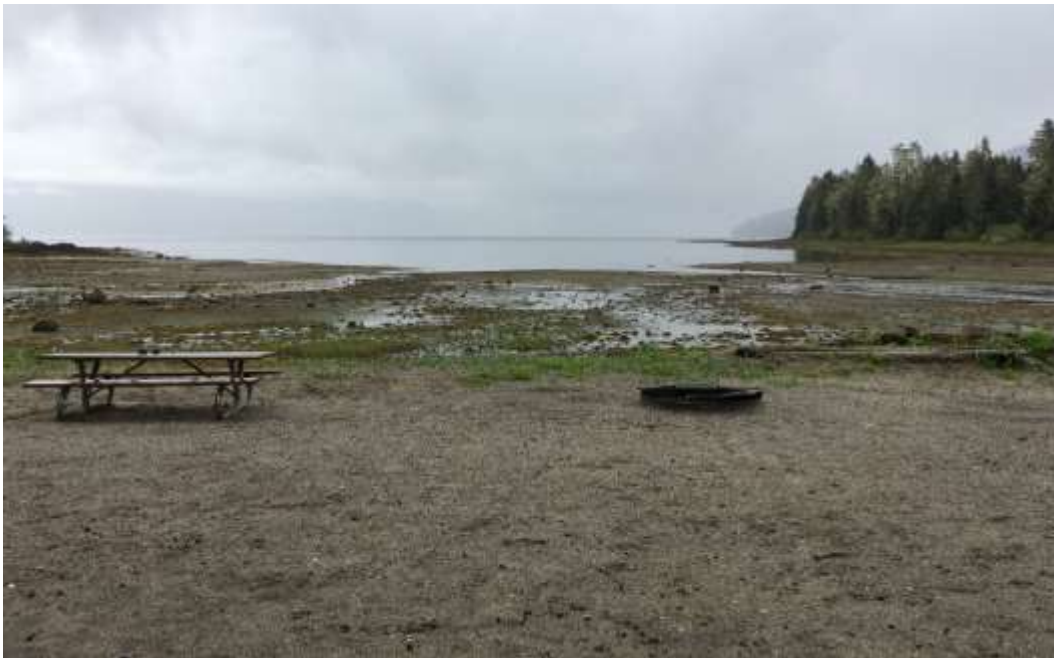
Sandy Beach, Petersburg, AK

In addition to monitoring harmful bacteria levels at beaches SAWC and PIA conducted education and outreach efforts to inform the Petersburg community of potential risks of contamination at recreational beaches, as well as current bacterial conditions. This program included newsletters, PSA's, electronic media, and an established partnership with the Petersburg Indian Association and the City and Borough of Petersburg. In conclusion, the community of Petersburg is now better informed of the potential risks and sources of bacterial contamination at recreational beaches as well as current bacterial levels at Sandy beach; and is better prepared to handle an incidence of unsafe levels of bacterial contamination to protect public health.