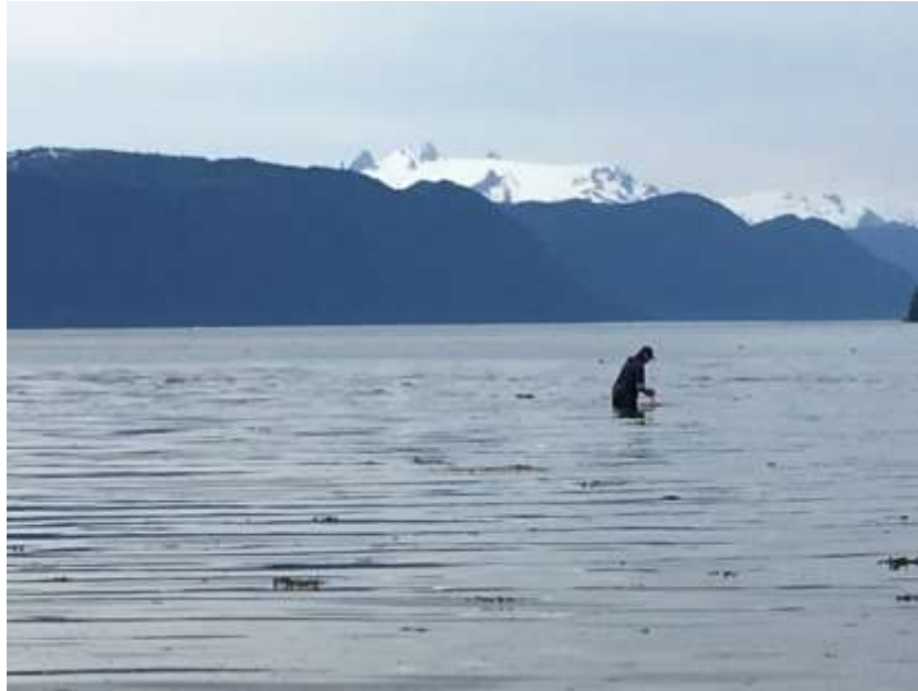
Sampling at Sandy Beach, Petersburg, AK