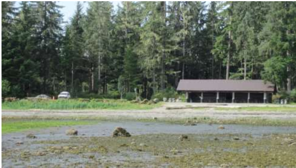
Sandy Beach Park, Petersburg, AK

Sandy Beach Park offers a wide range of recreational activities. Sandy Beach Park is located approximately 2 miles from downtown Petersburg and hosts walking, picnicking, fishing, camping, beach combing, wildlife viewing, and beach wading. A newly constructed shelter space makes using this area easily accessible.