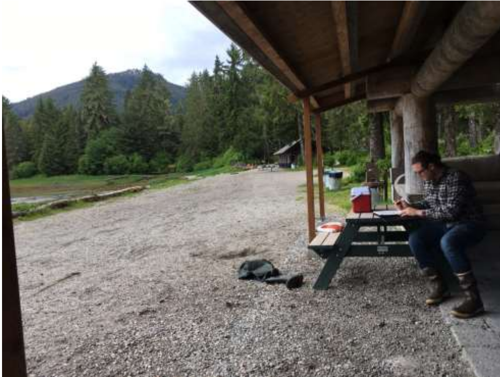
A PIA Technician records environmental conditions at the Sandy Beach sample site